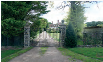
Entrance to Wamil Hall (listed building)