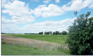
The site looking west towards the West Row