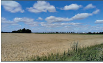
The site looking north towards the Air Base