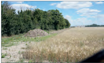
The site looking east towards The Hub