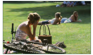
Informal Open Space