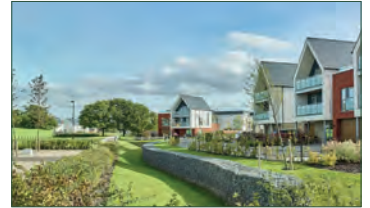
Formal Open Space