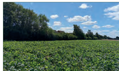
View south to existing hedgerow