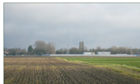
View toward Church