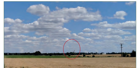
View east towards the church (circled)