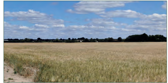
View west towards West Row