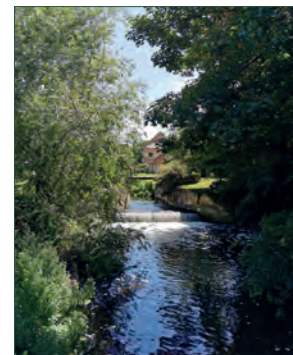
The River Lark